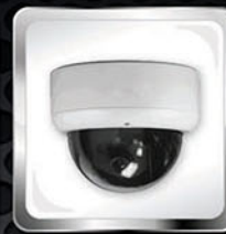
MEGAPIXEL / IP