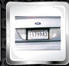
LICENSE PLATE RECOGNITION