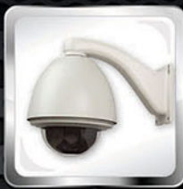
PTZ MOTION TRACKING